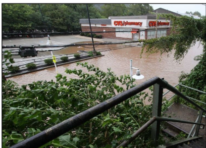
Flooding from Hurricane Irene, August 2011, Manayunk, PA

A hurricane is a tropical storm with winds reaching 74 mph. In other parts of the world, they are called typhoons. Hurricanes bring threats of heavy rain, strong winds, tornados and storm surges.