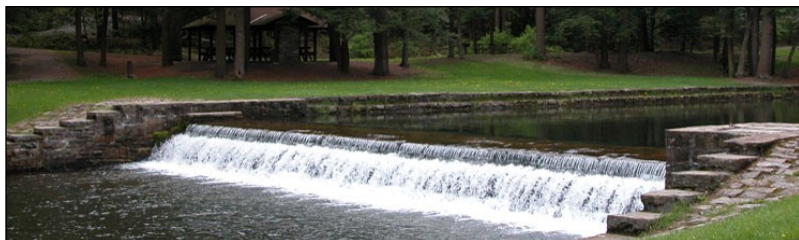
Dam at Ravensburger State Park

National Dam Safety Awareness Day was created to encourage and promote individual and community responsibility for dam safety. While there are benefits to dams, they can also be dangerous. Dam safety was not widely recognized until 1889, when the failure of South Fork Dam near Johnstown, Pennsylvania, claimed more than 2,200 lives.