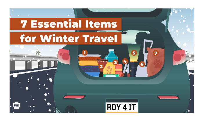
<u>Download graphic for Facebook and Instagram</u> <u>Download graphic for Twitter</u>